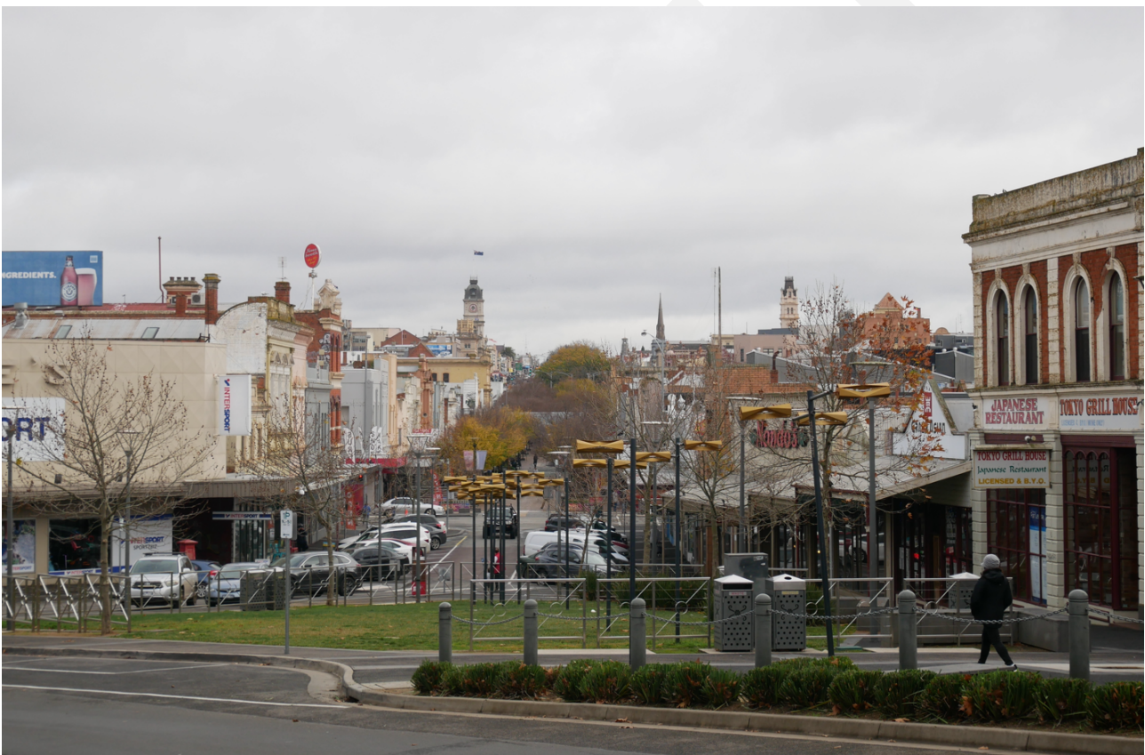
Looking west towards Bridge Mall from Bakery Hill (GJM Heritage, June 2021).