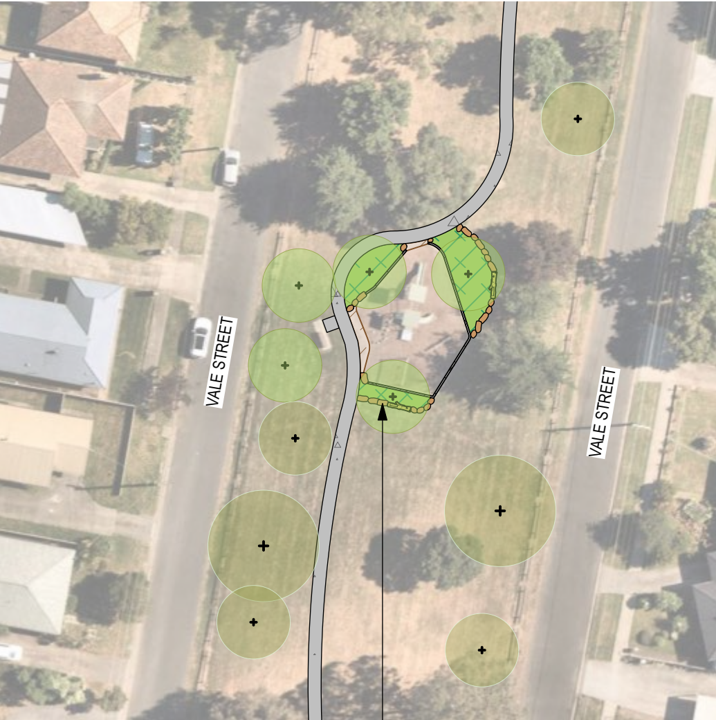
2 DETAIL PLAN Scale: 1:600

ADD GARDEN BEDS WITH BASALT ROCK & LOG EDGING TO EXISTING PLAYGROUND TO EXPAND ON EXISTING SECTION OF ROCK EDGE, WITH TREE PLANTING FOR NATURAL SHADE.