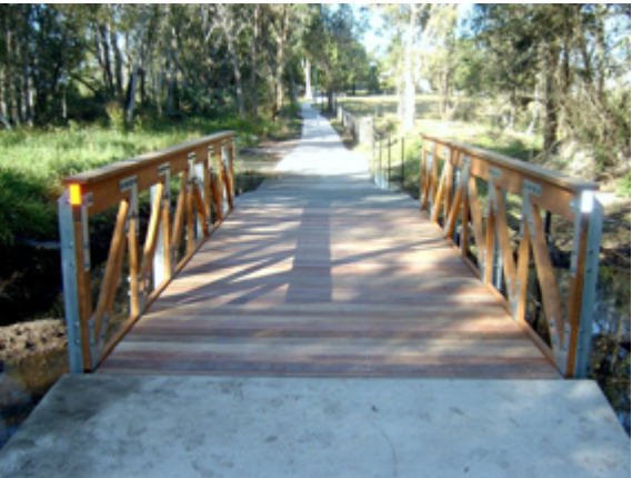
TIMBER TRUSS PEDESTRIAN BRIDGE PRECEDENT IMAGE