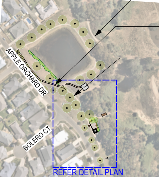
1 SITE PLAN Scale: 1:3000