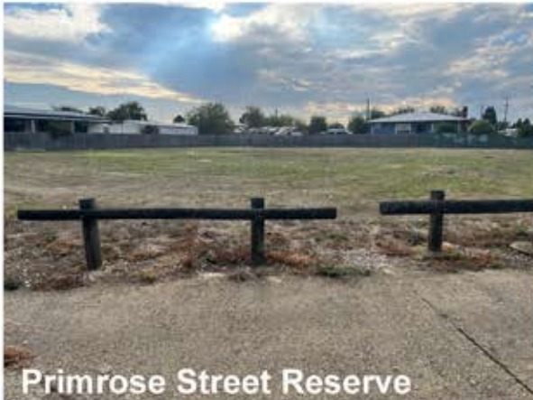
Primrose Street Reserve

Opportunity to improve all three open spaces each with their own character, play offering and amenity.