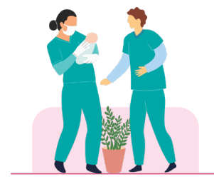
Maternal and child health centres