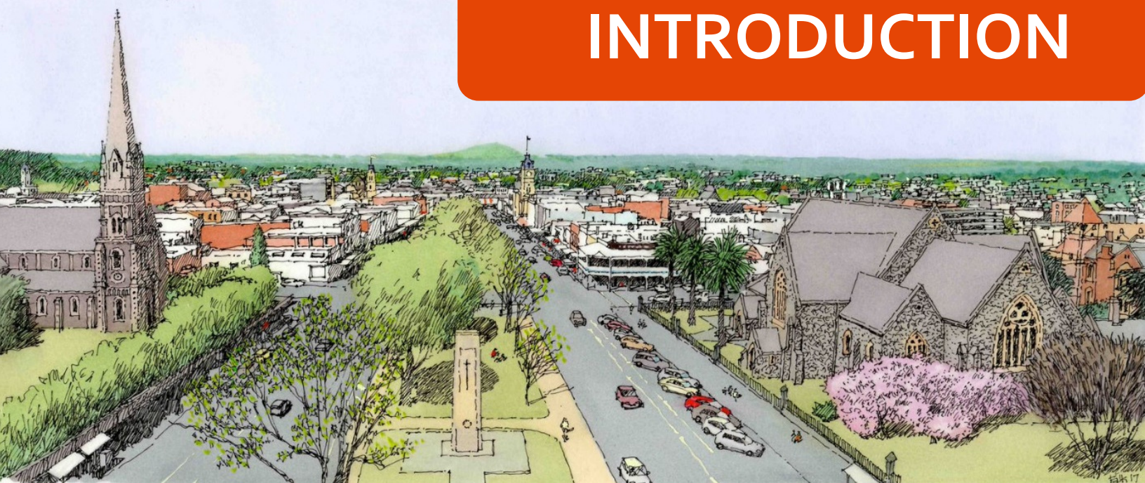
Image: Illustration of Ballarat's distinctive skyline as seen on approach from Victoria Street/Bakery Hill, Geoff Falk for City of Ballarat.

Heritage is of critical importance to the Ballarat community and our city's future. In whole-of-city consultations, the people of Ballarat said, of all the things they value, they love Ballarat's heritage the most and want to retain it. They also told us that they want Council to show leadership to achieve their vision. Our People, Culture & Place: A plan to sustain Ballarat's heritage 2017-2030 (the heritage plan) provides a best practice platform for making this happen. It is a living document which will continue to evolve over time as new opportunities and challenges appear. It commits us to stepping-up efforts to sustain Ballarat's heritage so that it is vibrant and celebrated into the future.