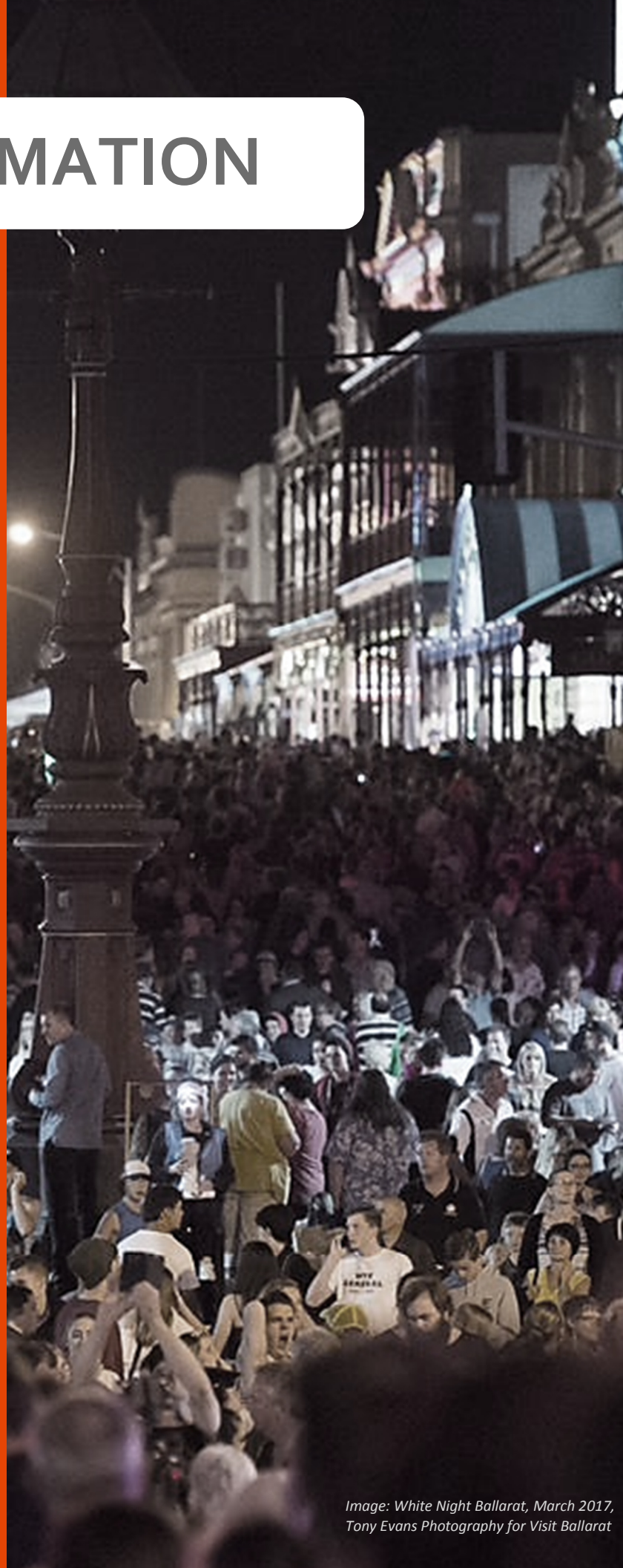
Image: White Night Ballarat, March 2017