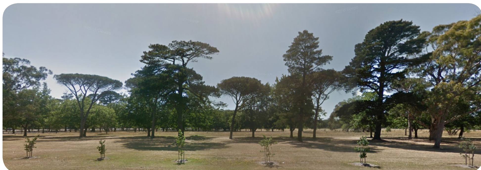
Photo from within Victoria Park, Ballarat