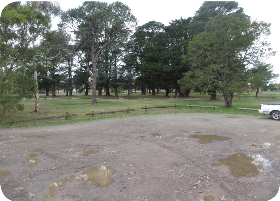
Unsealed car park