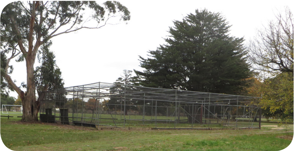
Existing cricket nets near club rooms