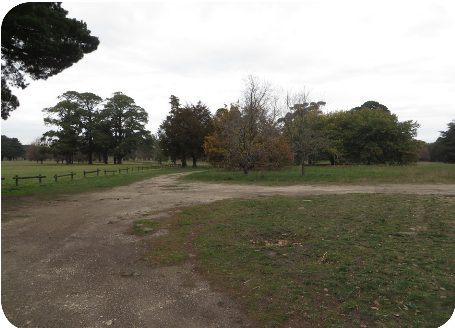
Example of uncontrolled vehicle movement