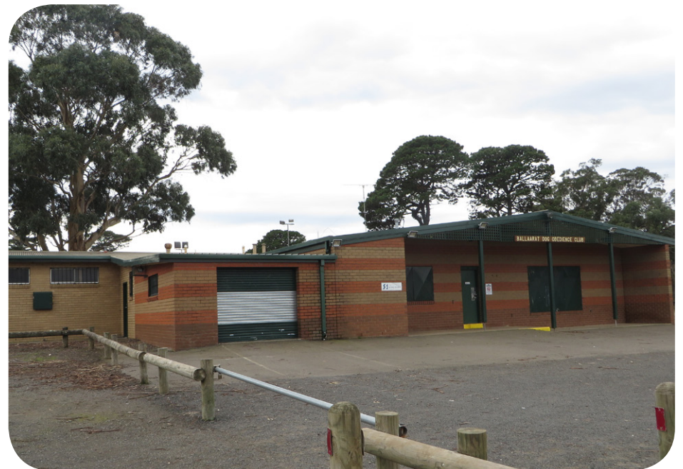
Existing club rooms