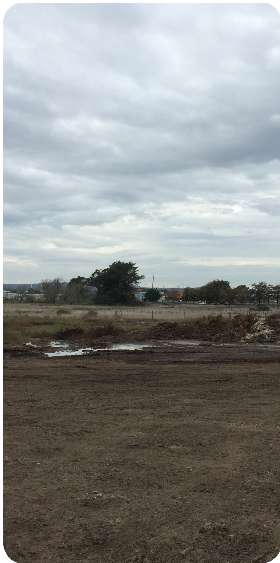
Photo of under utilised southwest corner