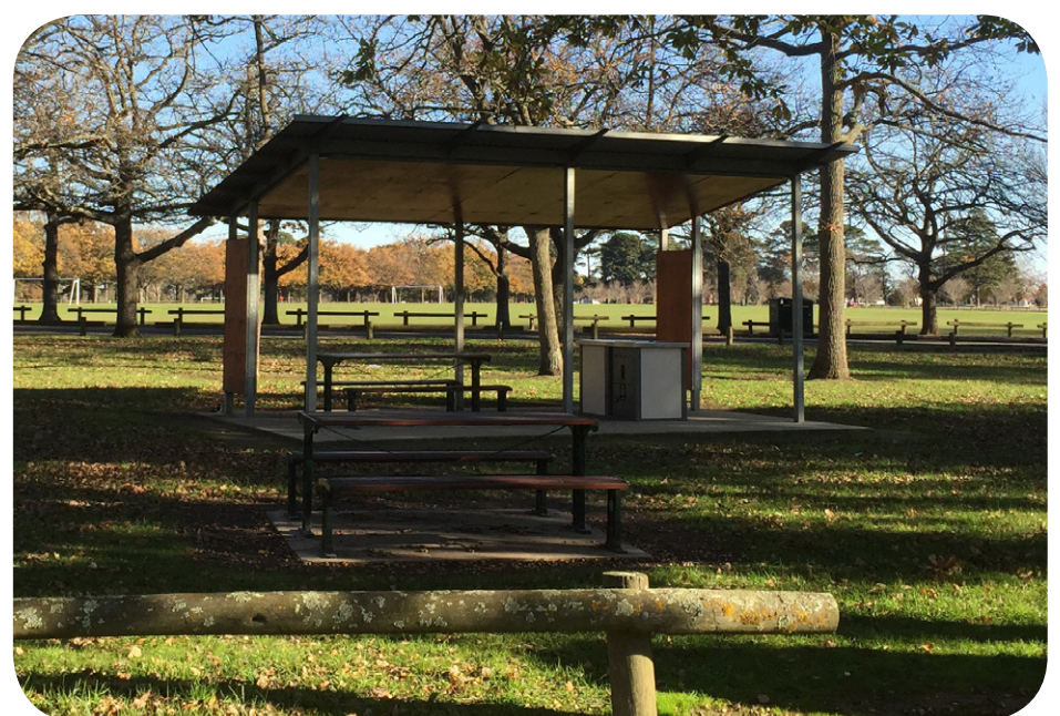
Existing picnic shelter on Sturt Street frontage