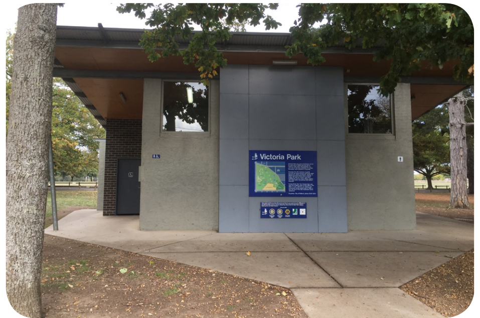
Existing public toilets on Sturt Street frontage