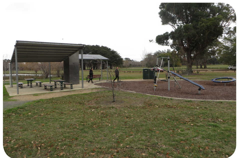
Existing playground and picnic area near lakes