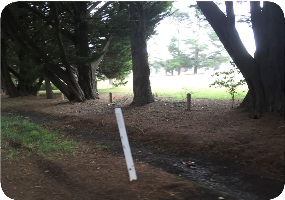
Roadside marker that has been hit by vehicle