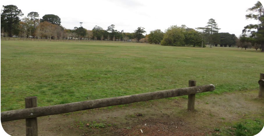
Existing sportsfield used for cricket