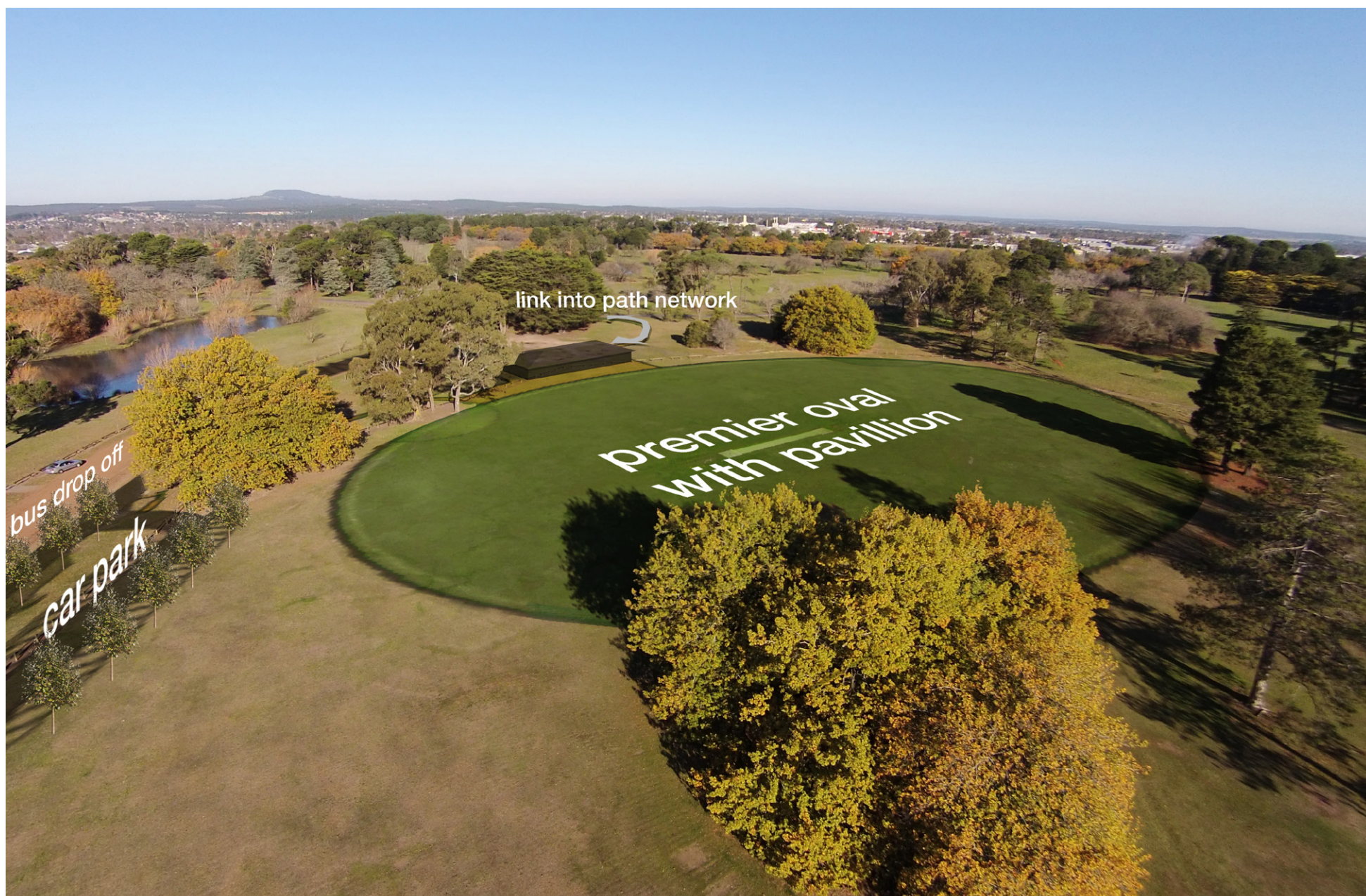
Artists Impression - Premier Oval Upgrade