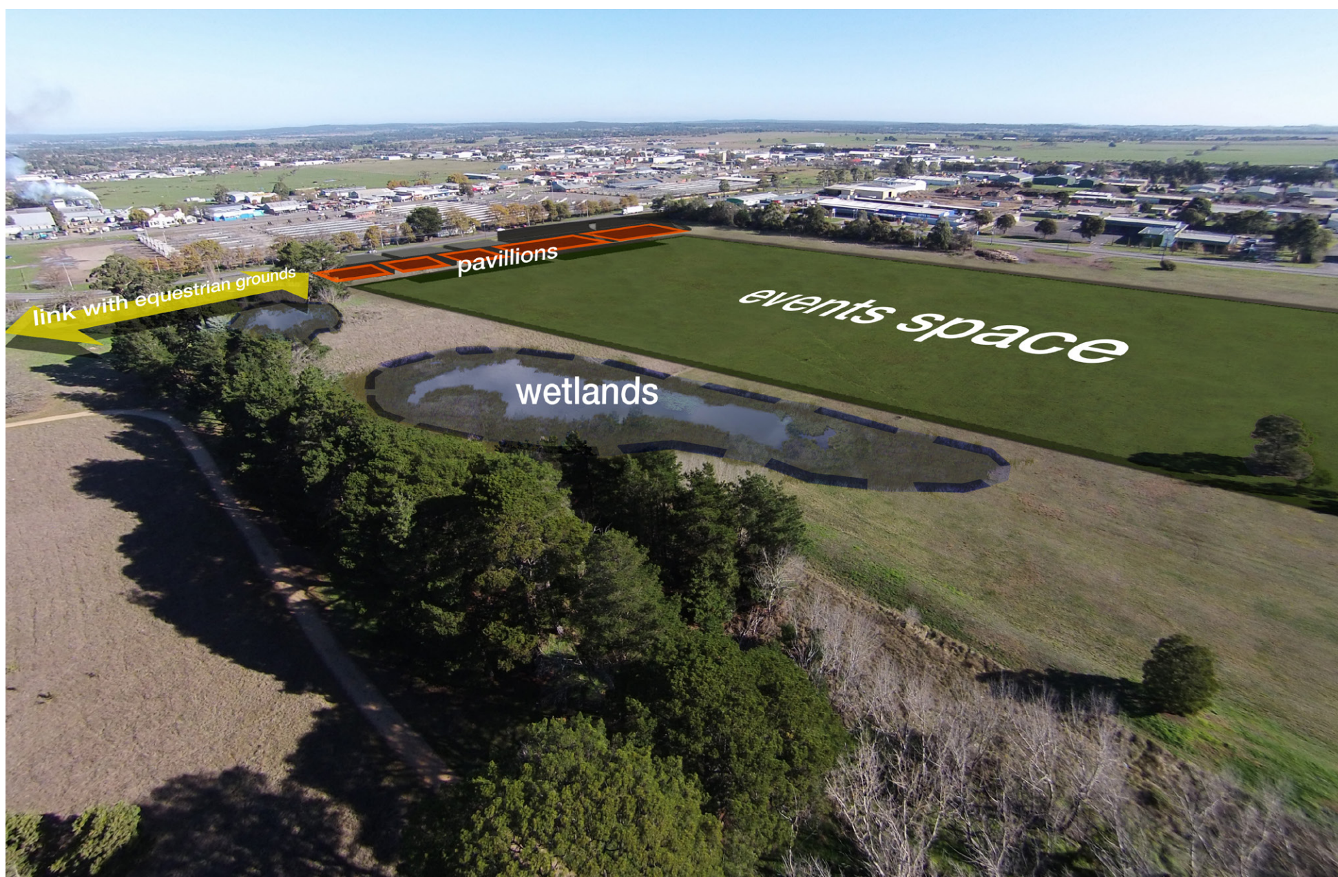
Artists Impression - Events Space with Pavillions

Provide equitable use of Park space, maximise use and improve safety and access to facilities for all users.