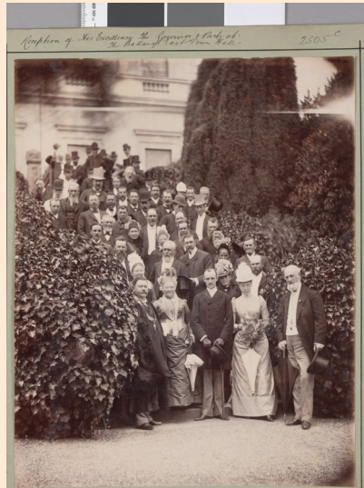
Reception for His Excellency the Governor of Victoria, Lord Hopetoun and his wife, Lady Hopetoun, 1890

These are significant for the key role they played in the development of civic identity and as a venue for significant civic events including visits by royalty and dignitaries representing many countries.