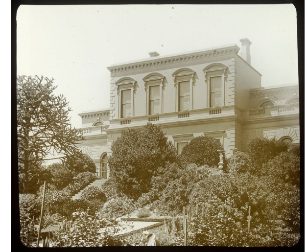
Town Hall Gardens Ballarat East, c1880s