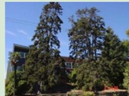
The Spanish Fir trees flanking the original Town Hall steps are listed by the National Trust.

Remnant mature trees have horticultural significance for their association with notable figures in the early history of horticulture in Victoria.