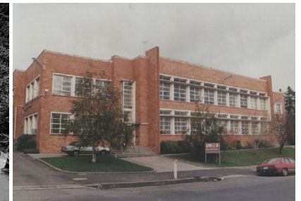
Community & educational precinct 20th & 21st Centuries

The design and layout of the grand Gardens reflected the influence of 19th Century British ideals of society – ordered, self-improving and prosperous – and played an important role in the development of civic identity and the rehabilitation of the mining landscape.