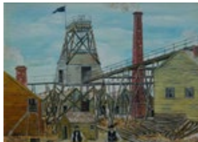
Mining landscape 1851+

The Wadawurrung people occupied the thickly forested and rich volcanic landscape.