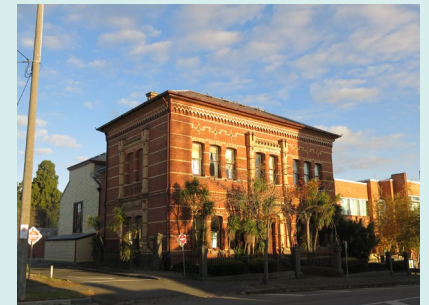
Former Free Library, Barkley Street 1867-8

The former Free Library is significant for its architectural, historical and social values and as the last remaining early public building associated with the Borough of Ballarat East.