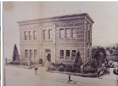
Civic Precinct 1862-63

Post European settlement, the precinct, together with the wider Ballarat East area, was the site of significant gold mining activity. This led to the degradation of the landscape.