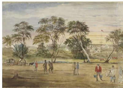
Wadawurrung Country 50,000+ years