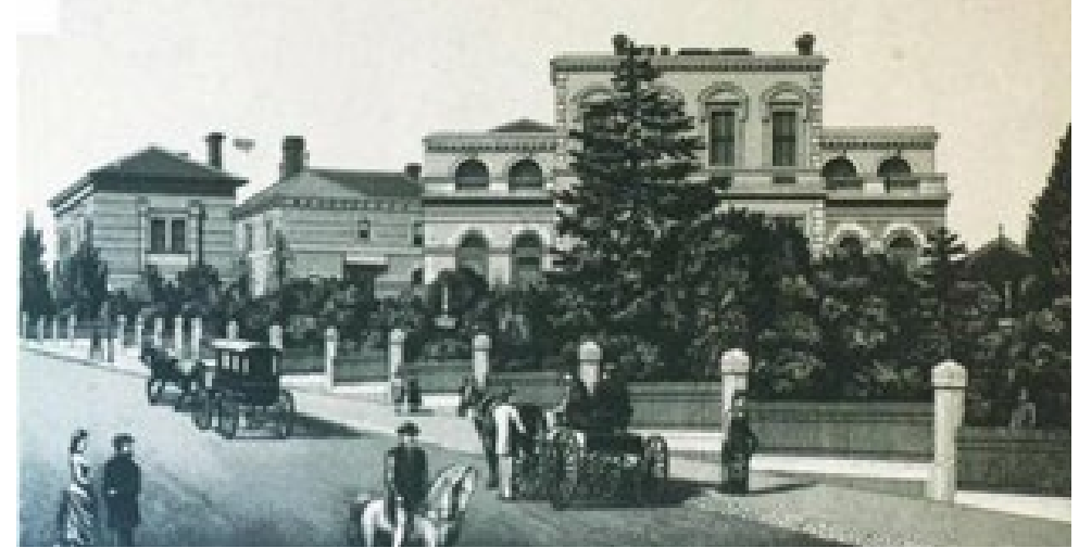
Sketch of the Town Hall Gardens, c1881-90