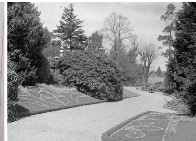
Town Hall Gardens 1863+

The early development of Ballarat East as a municipality with a separate political and social identity to Ballarat West involved the development of key buildings including the Town Hall, Police Court, Free Library and Fire Station.